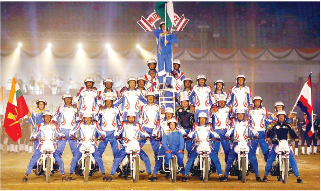
Glimpses of the gripping stunts by armed forces personnel of country's first-ever military tattoo and tribal dance festival 'Aadi Shaurya - Parv Parakram Ka', organised by the Ministries of Defence and Tribal Affairs as part of 74 th Republic Day Celebrations 2023, at Jawaharlal Nehru Stadium, in New Delhi. A military tattoo is a performance of music or display of the armed forces

A session on 'Gender Equality' reinforced the urgent need for action on gender equality and brought together leaders from across generations, sectors and continents to discuss their focus, highlight challenges, progress, inspiring commitments and essential action needed for urgent progress for women and girls.