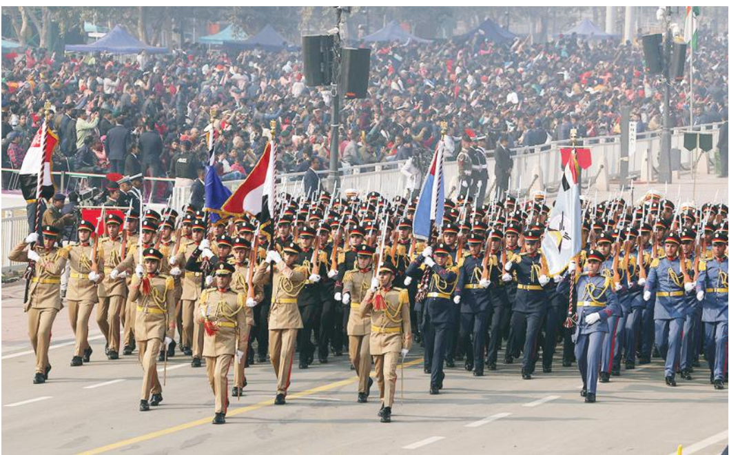
A contingent of the Egyptian Military marches past during the full dress rehearsal of the 74th Republic Day Parade 2023, at Kartavya Path in New Delhi

and ecology. There must be a global vision for ecological safeguard, or else we will sink together," said the minister. Focussing on the brighter sides of women empowerment, Mr Munda said "it is time for the world to reorient the focus from women development to women-led development. There is a need for financial inclusion for people's economic empowerment and it is a bedrock of our development strategy. One of our key priorities is to deliver financial services to the last mile and to the poorest of the poor across the country".